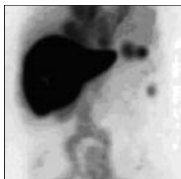
Figure 3. Tc-99m sulfur colloid scintigraphy

Additional examinations including tumor markers, chest radiography, colonoscopy and neck ultrasound were negative. Patient underwent to Tc-99m sulfur colloid scintigraphy which showed multiple oval splenic implants in the abdomen. Some of them adjacent to the diaphragm (Figure 3). Subsequently, abdominal splenosis following the post-traumatic splenectomy was diagnosed.