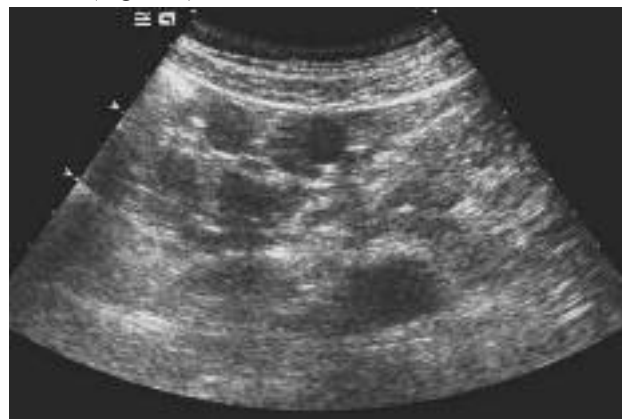
Figure 1. Ultrasound reveals multiple round nodules around the left kidney

tests including complete blood count, urology laboratory tests, gamma-glutamyl transferase, alkaline phosphatase, aminotransferases, amylase, glucose, electrolytes and blood lipids did not reveal any abnormalities. He denied any symptoms suggestive of adrenal hormone hypersecretion, and the physical examination was negative for any signs of hyperfunctioning adrenal tumor. Esophagogastroduodenoscopy showed mild gastritis. Abdominal ultrasound revealed no spleen, and a few enlarged lymph nodes in the left hemiabdomen (Figure 1).